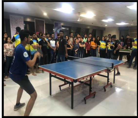
Students participating in the events