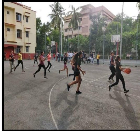
Students participating in the events