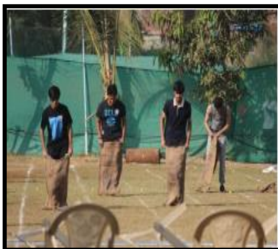
Students participating in the event