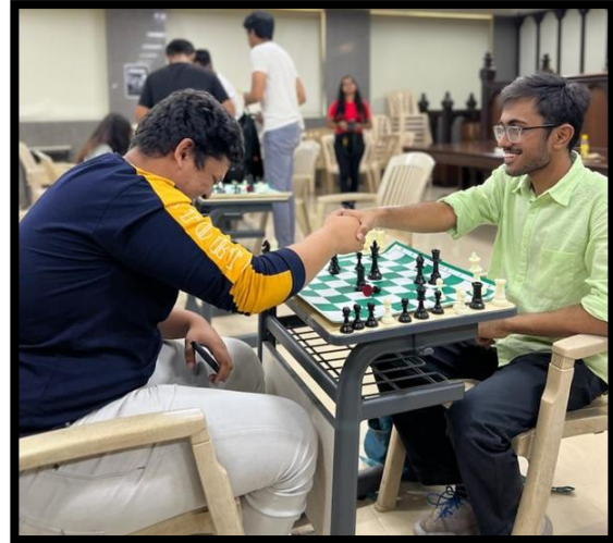
Students participating in the events