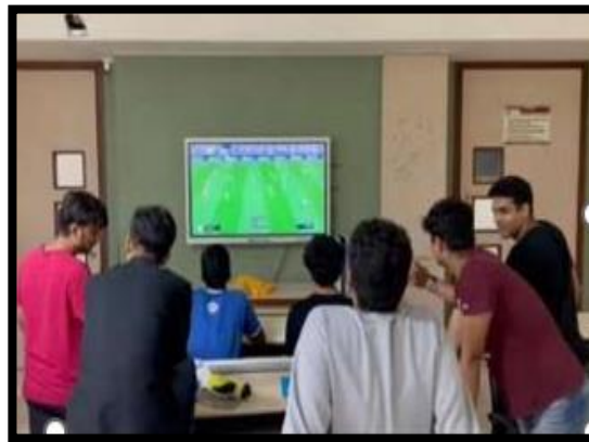
Students during the event