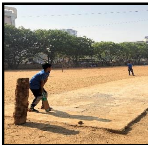
Students participating in the events