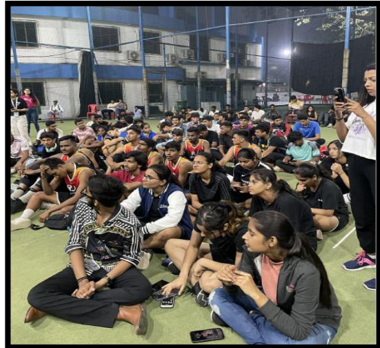
Students participating in the events