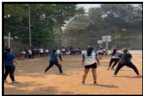
Students participating in the events