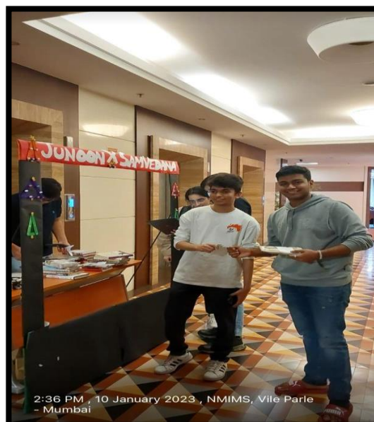
Students donating books for the cause