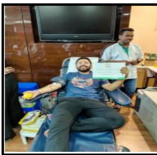
Students donating the blood