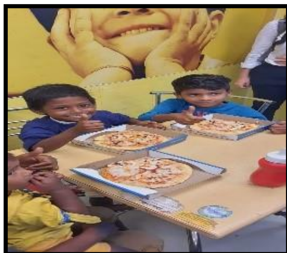
Distribution of food to street kids