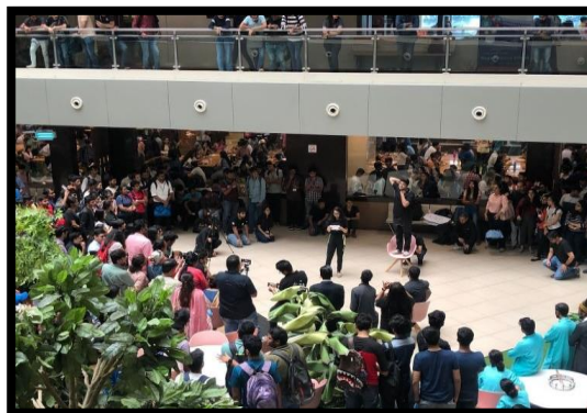
Students engaged in street play in the campus