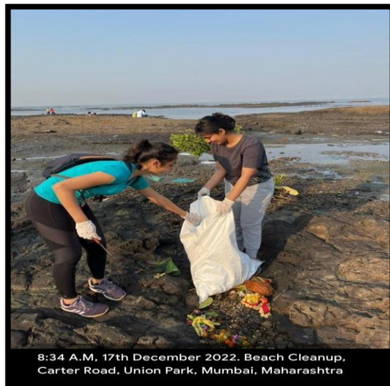
Student Volunteer at the beach clean-up drive