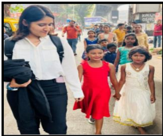
Student Volunteer during the drive