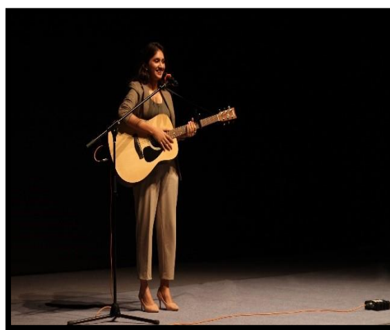
Students participating in the event