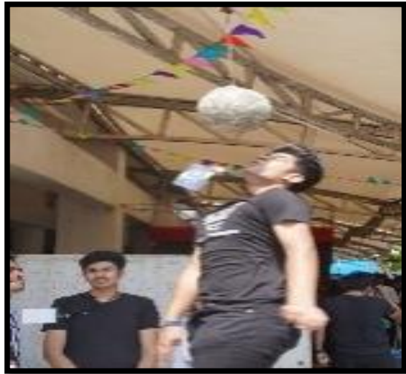
Student participating in the event