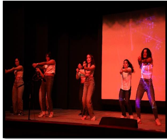
Students participating in the event