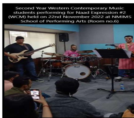
Students participating in the event