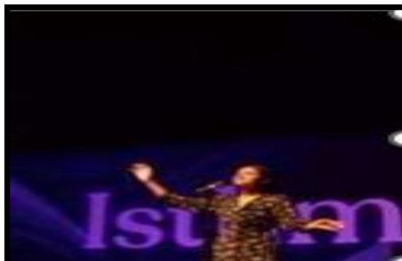
Students participating in the event