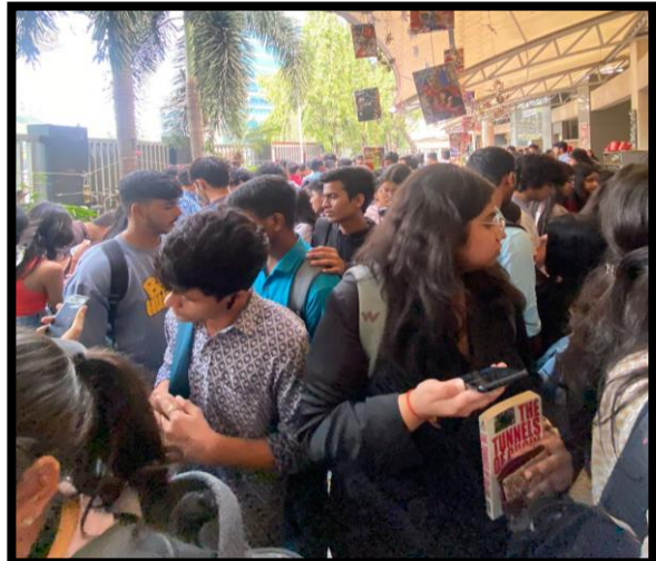
Stalls set up during the event