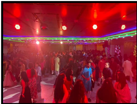
Students during the Garba night