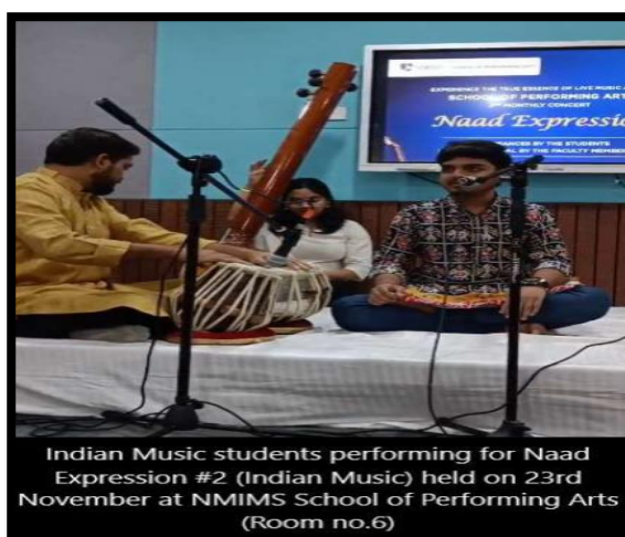
Students participating in the event