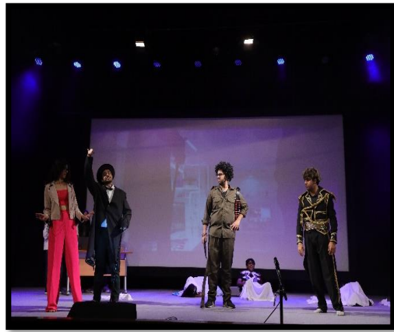
Students participating in the event